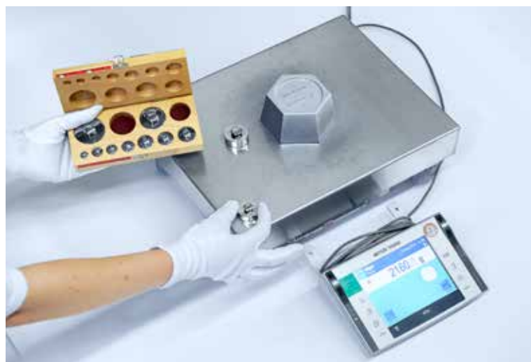
Calibration of the used balances

The advantage of this method is the high level of flexibility; the disadvantage is the systematically low process accuracy.