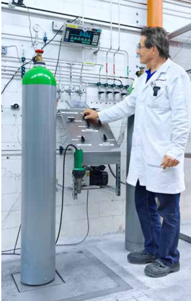
Gravimetric production of gas mixtures in Lenzburg

The most common procedure for manufacturing of high precision calibration gas mixtures is the gravimetric method according to ISO 6142 (Gas analysis - Preparation of calibration gas mixtures - Gravimetric method). This method is based on weighing the masses of the particular components. Weighing is one of the most accurate physical measuring methods, which is why the gravimetric preparation is employed to manufacture high precision calibration gas mixtures.